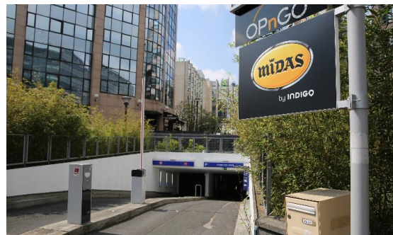
Entrée du parking Indigo Place Abel Gance

Nor was the choice of the Boulogne-Billancourt car park a coincidence: it is located in a strategic business district. Covering three levels, it offers a total of 525 spaces (including nearly 400 for subscribers), with company cars accounting for a 75% share. Various big companies like TF1, Canal+ and France Galop have offices directly above the car park and make many cars available to their employees. This in turn offers many opportunities to retain customers through this innovative service that offers added benefit for Indigo users.